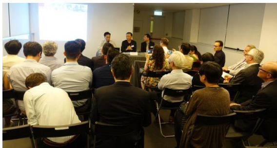
HKIUD 7 th Annual General Meeting was held on 13 September 2017.