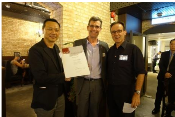
Presentation of Certificate to Corporate Affiliate: TFP Farrells Ltd.