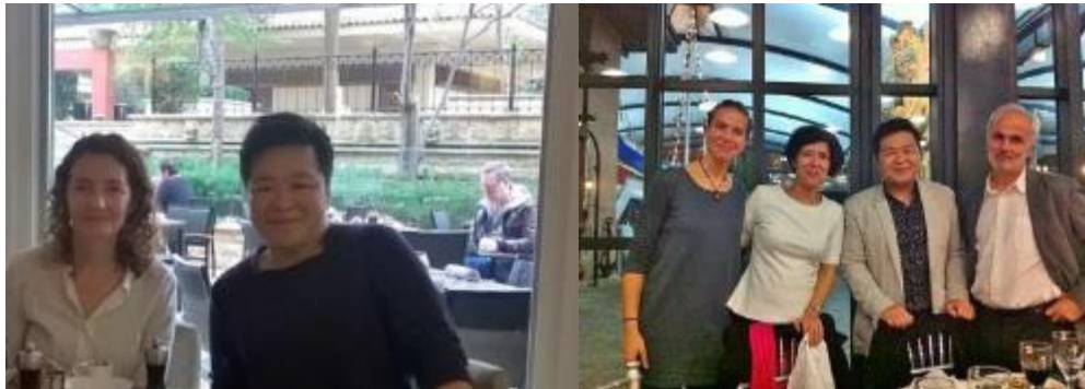
Photo with Key Note Speaker Prof. Caroline Bos, Co-founder, Principle Urban Planner, UN-Studio (Left).