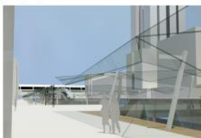
View from Cheong Shing Path to Long Ping Station