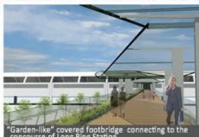
"Garden-like" covered footbridge connecting to the concourse of Long Ping Station