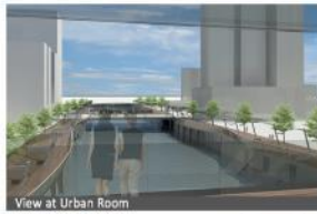
View at Urban Room