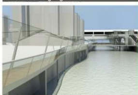
View from Castle Peak Road - Yuen Long to Long Ping Station