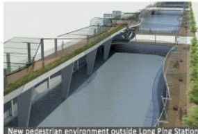
New pedestrian environment outside Long Ping Station