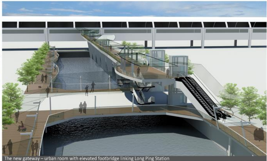
The new gateway - urban room with elevated footbridge linking Long Ping Station