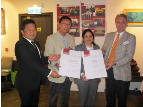
Presentation of Certificates to Corporate Affiliates: Architecture Design and Research Group Limited and Urban Design & Planning Consultants Limited