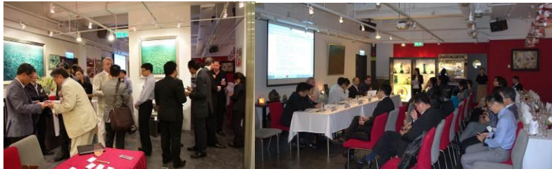
HKIUD Annual General Meeting (AGM) and dinner held on 1 September 2011.